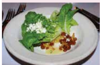
Bib Lettuce Wedge Salad with roasted cauliflower and crumbled feta cheese

A big thank you to The Butcher Shop culinary and service teams for their excellent execution and warm hospitality throughout the evening. For more information on Stag's Leap Wine Cellars, visit stagsleapwinecellars.com .