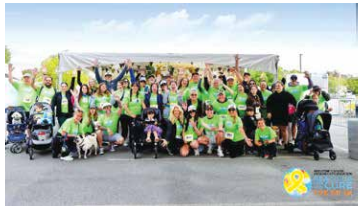
Team Powerstone raised $115,040 for the Pediatric Cancer Research Foundation at the annual Reaching for the Cure event.

Known for its exceptional service, Powerstone is a recognized leader and one of the largest property management firms based in California. Since 1993, Powerstone has served the common interest development industry with integrity, professionalism, and expertise, including three on-staff CPA's and an in-house General Counsel and Learning Academy. From professional business planning, governance, and community management, to modern yet easy to use customized websites and on-line services, Powerstone provides homeowner associations complete and unparalleled service including customized Community Planning. Powerstone believes that every association deserves the chance to