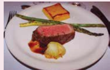
Grilled Prime New York Strip with rosemary demi-glace, seared polenta

Exciting wine dinners continue in Ercolano's lineup. Del Mar's West End Bar & Kitchen is hosting a Duckhorn Vineyards Five Course Winemaker