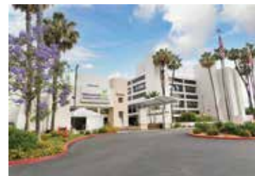
Saddleback Medical Center

About MemorialCare MemorialCare is a not-for-profit, integrated healthcare delivery system with 225 care locations, including leading hospitals—Saddleback Medical Center in Laguna Hills, Orange Coast Medical Center in Fountain