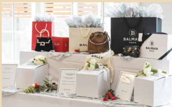
Designer handbags from Roger Vivier, Bally, and Balmain dazzled guests as part of the luxe prize lineup