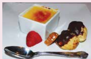
Dessert Trio with Passion Fruit Crème Brûlée, profiteroles, and a piece of almond brittle